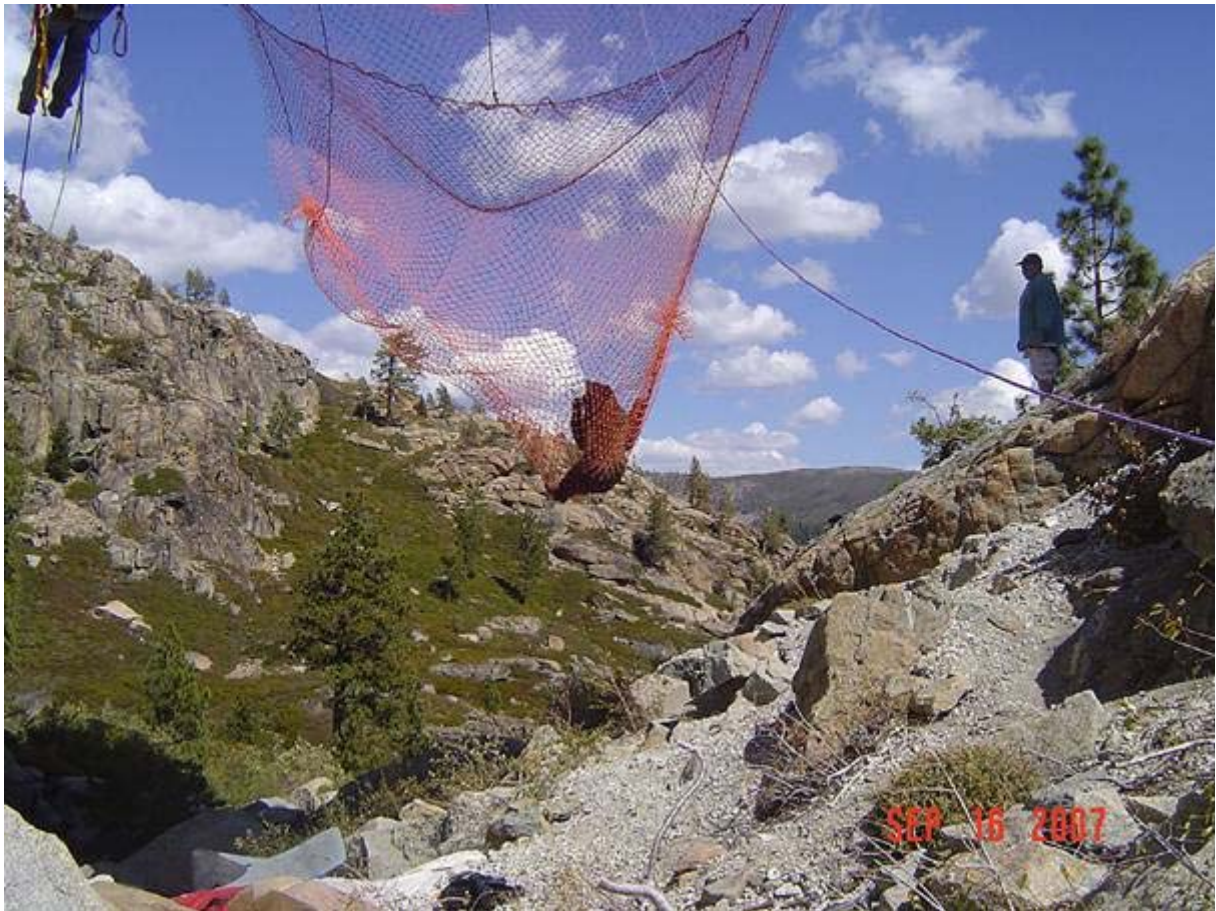
then woke up and walked out of the net.