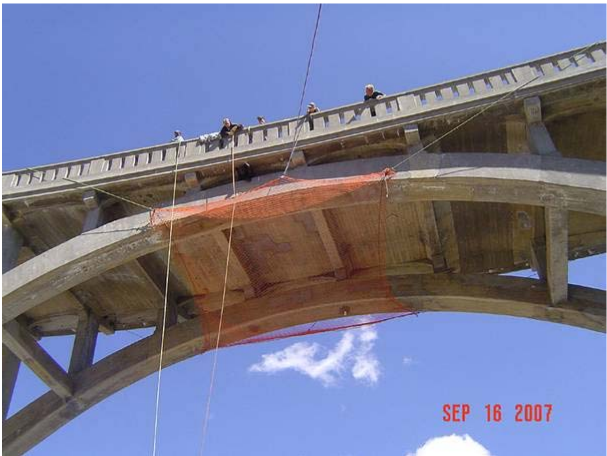
After securing a net under the bridge the bear was tranquilized,