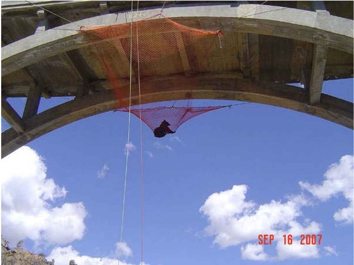
fell into the net, and lowered,